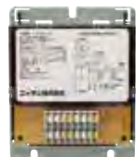
Test station for 4-zone