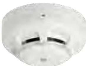
Dual optical smoke detector