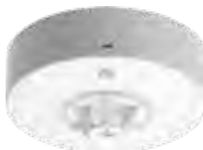
Rate of rise heat detector