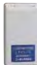
Test station for 1-zone