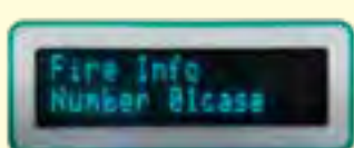
Information Display Fire Alarm Info